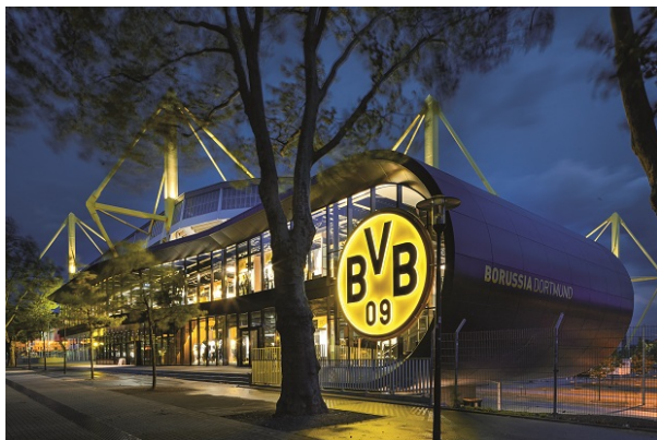
Caption 1: The lighting concept of "BVB Fan World" in the Signal Iduna Park was developed by Zumtobel.