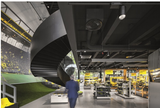
Caption 4: Zumtobel uses ARCOS Xpert spotlights to make sure that the photo wall is staged to perfection.