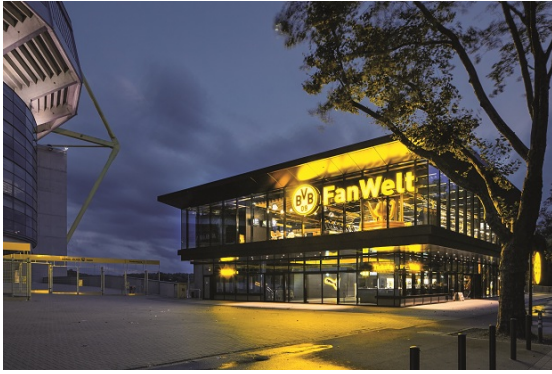
Caption 2: An important aspect in the Fan World's design was to find a perfect lighting system for the various areas of the building that could also be adjusted flexibly and quickly.