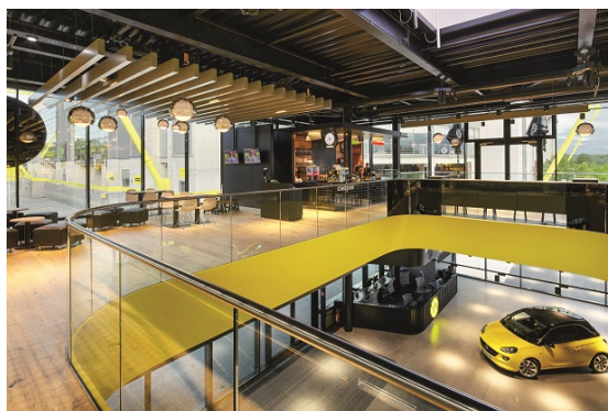
Caption 5: The spherical SCONFINE SFERA pendant luminaires provide pleasant ambient lighting thanks to their chrome-plated luminaire unit.